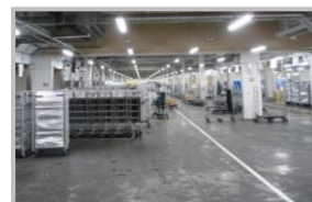
Factory / Warehouse